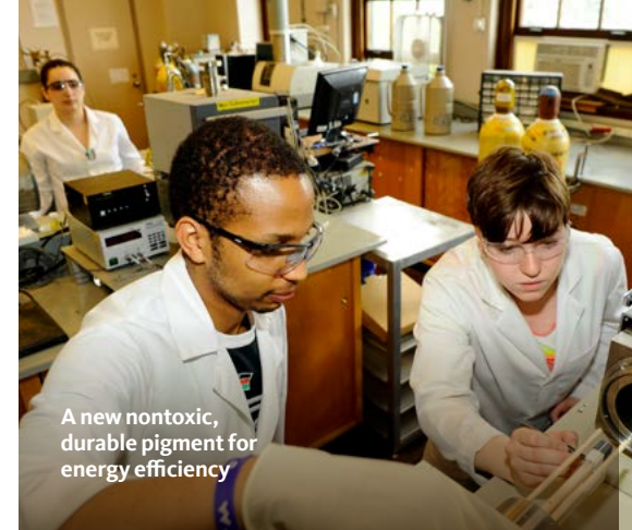
A new nontoxic, durable pigment for energy efficiency

Chemistry graduates are successful in top tier graduate schools in areas of analytical, materials, physical chemistry and bio-organic chemistry as well as in professional programs in science education, business, forensic science, pharmacy, medicine and dentistry. Many graduates work in a wide range of careers throughout the Pacific Northwest and across the country.