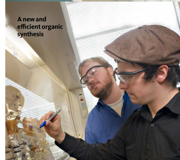
A new and efficient organic synthesis