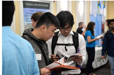
Create Résumés, CVs and Cover Letters