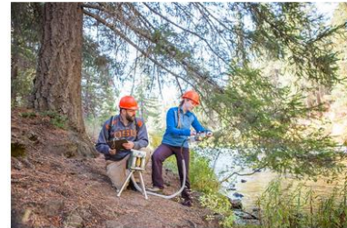
Find a Job, Network and Interview