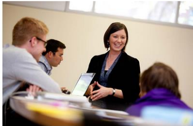
Explore Majors, Programs and Career Paths

Wherever you're at in your career development, wherever you're going, we want to empower you with resources and support. Discover professional interests, communicate your skills and develop authentic connections with future employers, grad schools, service organizations and more. Whether you're a first-year student or a Ph.D. student, in Corvallis or across the country, we're focused on helping you move toward your unique future. Want more info? Check out the Career Development Center overview .