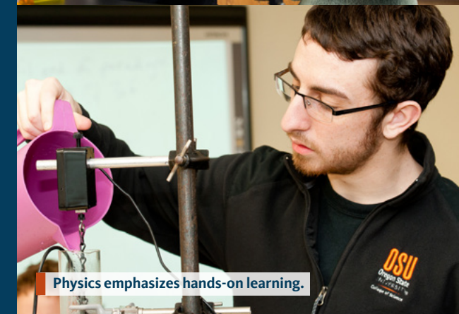
Physics emphasizes hands-on learning.