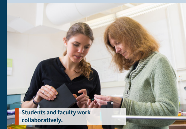
Students and faculty work collaboratively.