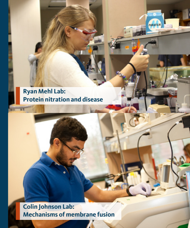
Ryan Mehl Lab: Protein nitration and disease

Biophysics Biochemistry Lab Elective Credits